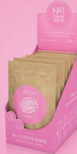
100g | 8 packages