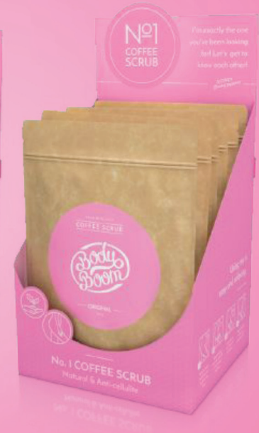
200g | 6 packages