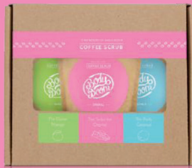
30g | 3 packages

All the BodyBoom's coffee scrubs are delivered in easy to fold packaging ready to be place on the shelves. Their height can be adjusted to the height of the shelves.