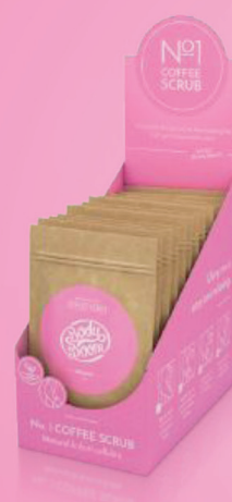
30g | 12 packages