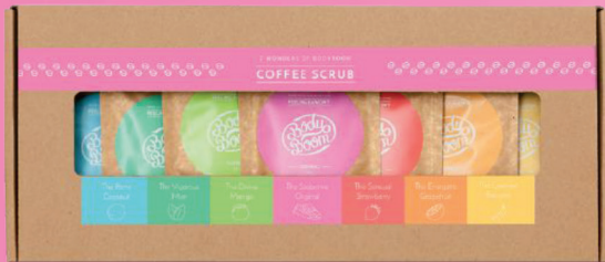
30g | 7 packages